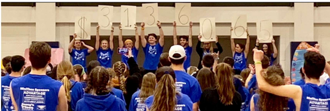
QCHS’s MiniTHON raised $31,360.65 in April, more than doubling last year’s donation of just under $15,000. All funds go to the Four Diamonds at Penn State Children’s Hospital to help in the fight against pediatric cancer.