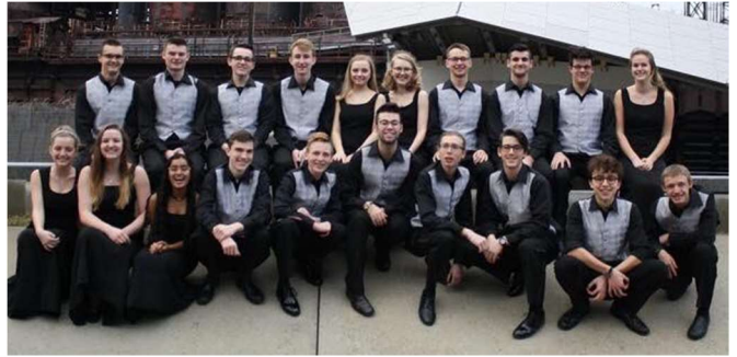
Our award-winning Jazz Ensemble at the Steel Stacks Jazz Festival in April. QCHS's band and choral programs are genuinely second to none.

—Average ACT Score: 24 – English: 24 | Math: 24 | Reading: 25 | Science: 24